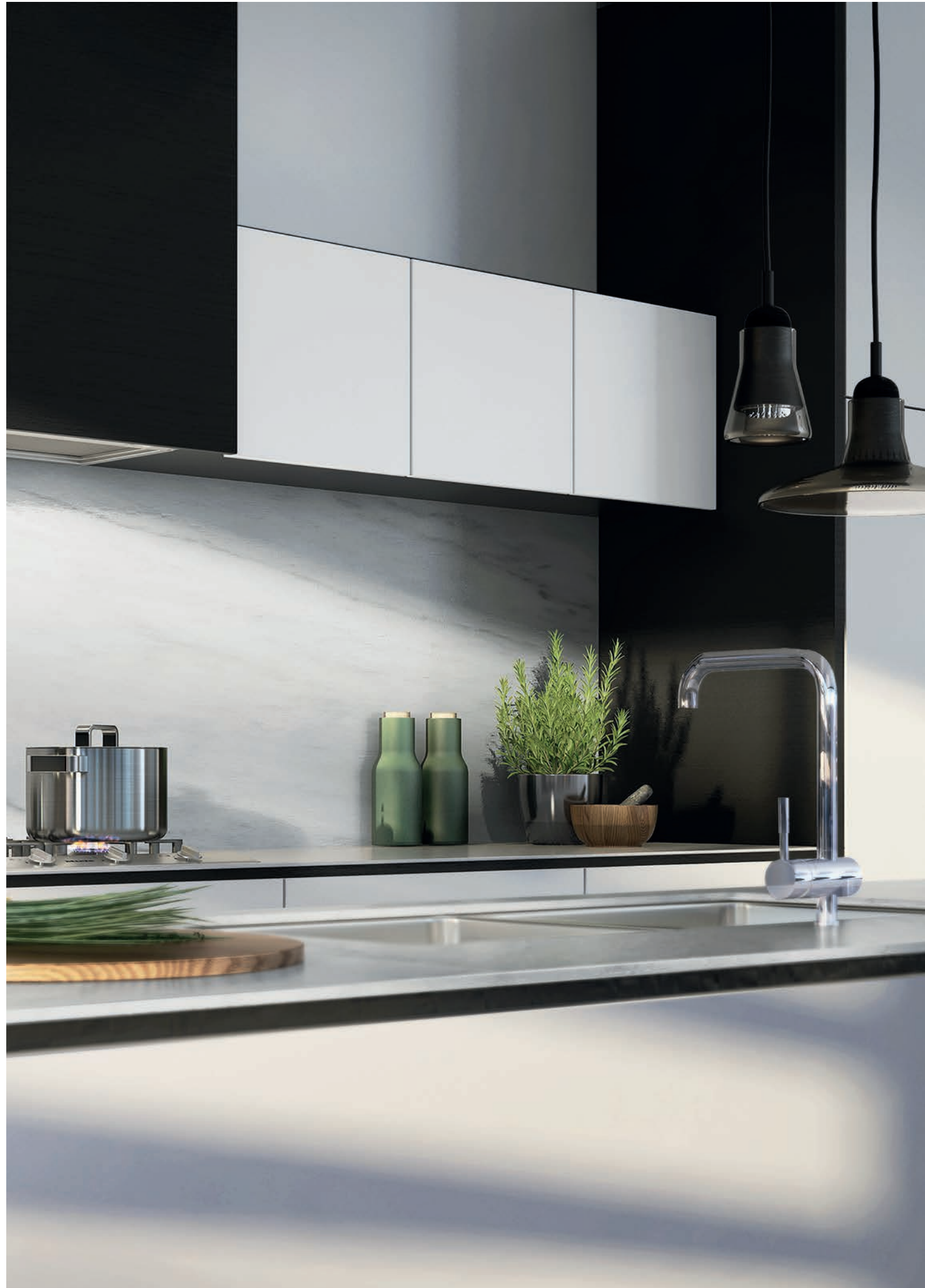
KITCHEN DETAIL — ARTIST IMPRESSION