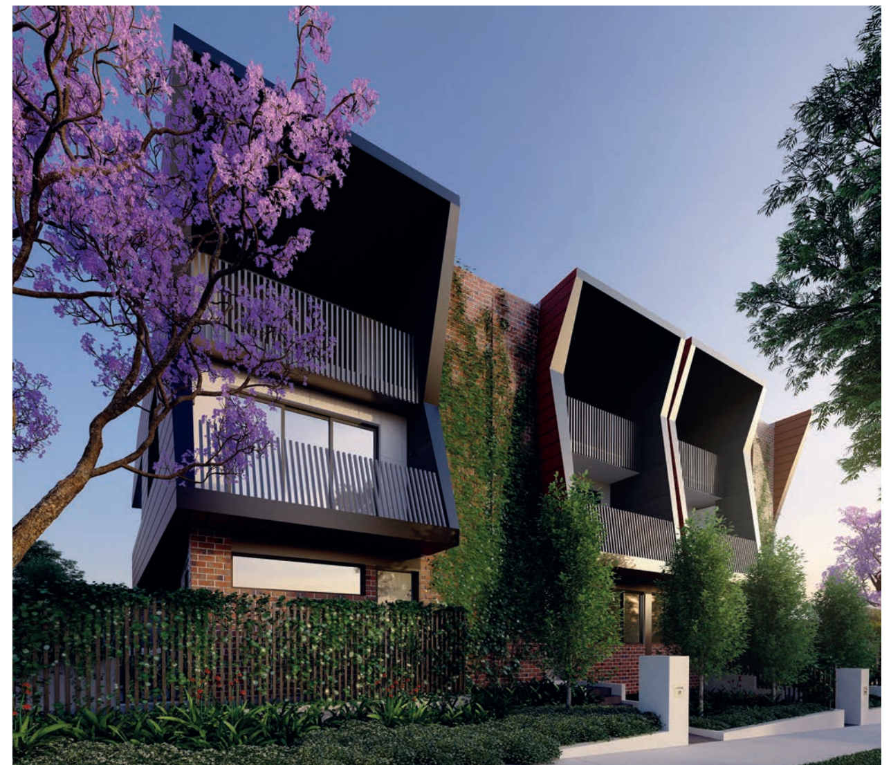
Clockwise from top left: Elsternwick Place facade; Richmond Place interior; McKinnon Place facade.