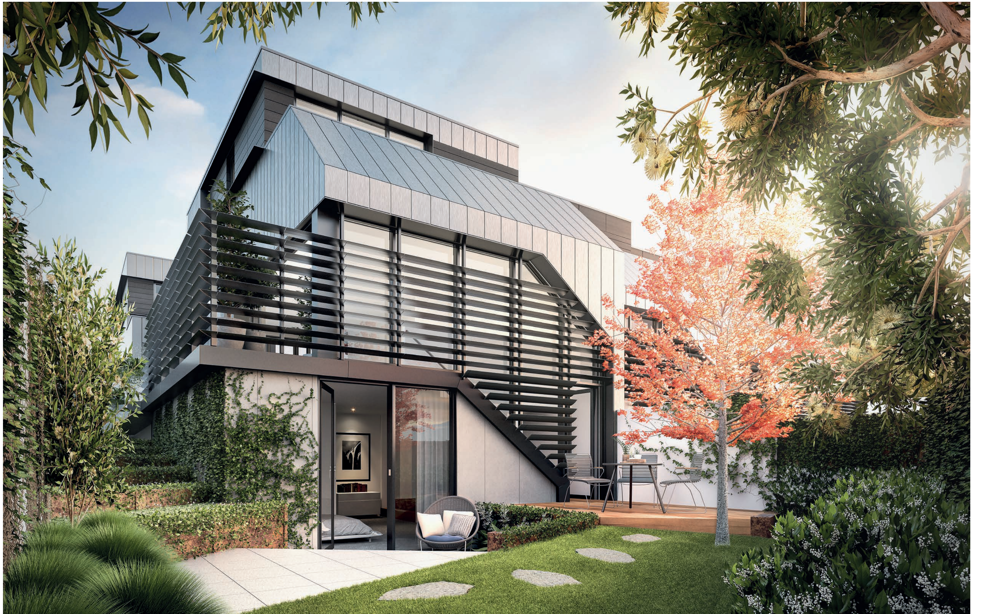
REAR EAST FACING COURTYARD — ARTIST IMPRESSION