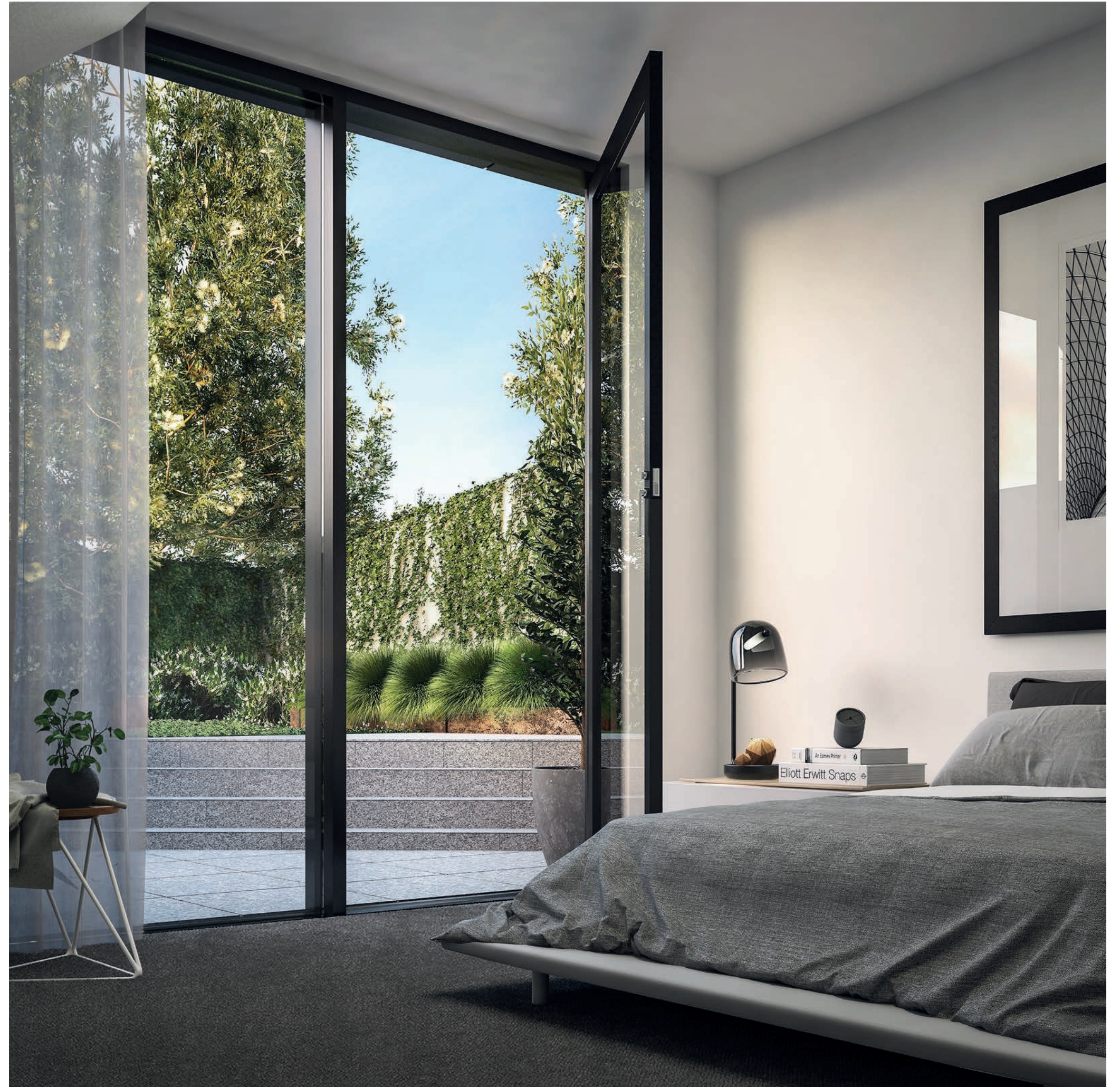
BEDROOM — ARTIST IMPRESSION

Each of the townhomes at Atherton Terrace is a spacious and beautifully appointed sanctuary. Featuring the warmth of timber flooring, plush bedroom carpeting and a wealth of practical solutions designed to enhance everyday living. Generous interiors open up to large landscaped terraces and courtyards, offering sophisticated living and plenty of natural sunlight.